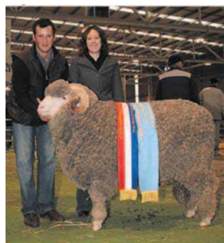
Bendigo 2008 Grand champion fine/medium wool ram –East Strathglen George