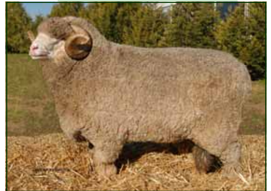
H.M. JUNIOR 12-119 (040119)