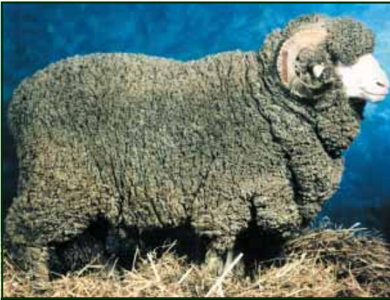
HIS MAJESTY WHITE 10

Big Bold Sons for the 2009 Ram Sale see them at our Open Day