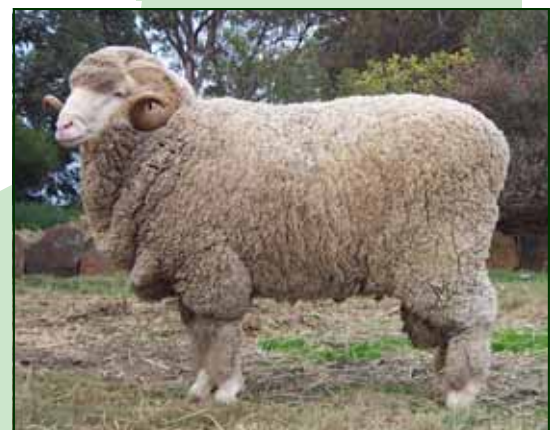
H.M. JUNIOR 12 (020012)