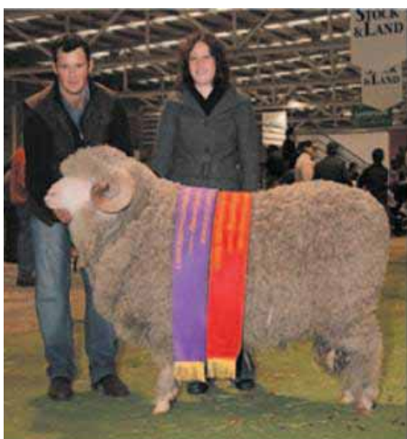
East Strathglen Prince–Wagin Woolarama supreme exhibit and reserve champion medium wool Merino ram - Bendigo 2008

Congratulations to the Sprigg family, East Strathglen for Grand Champion Merino Ewe, Grand Champion medium merino ewe, Grand Champion fine/medium Merino Ram both sired by Charinga Junior 12.