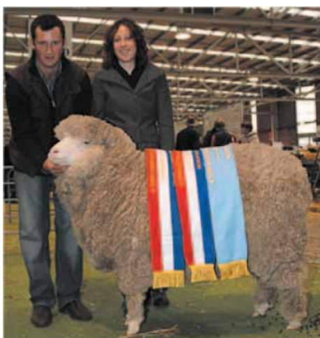
Bendigo Grand champion Merino ewe, East Strathglen Princess II (Full sister to East Strathglen Princess)