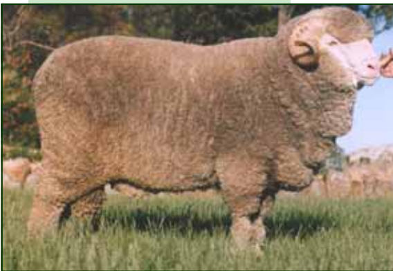
CHARINGA “MUNCHY” His Majesty HM 10-398